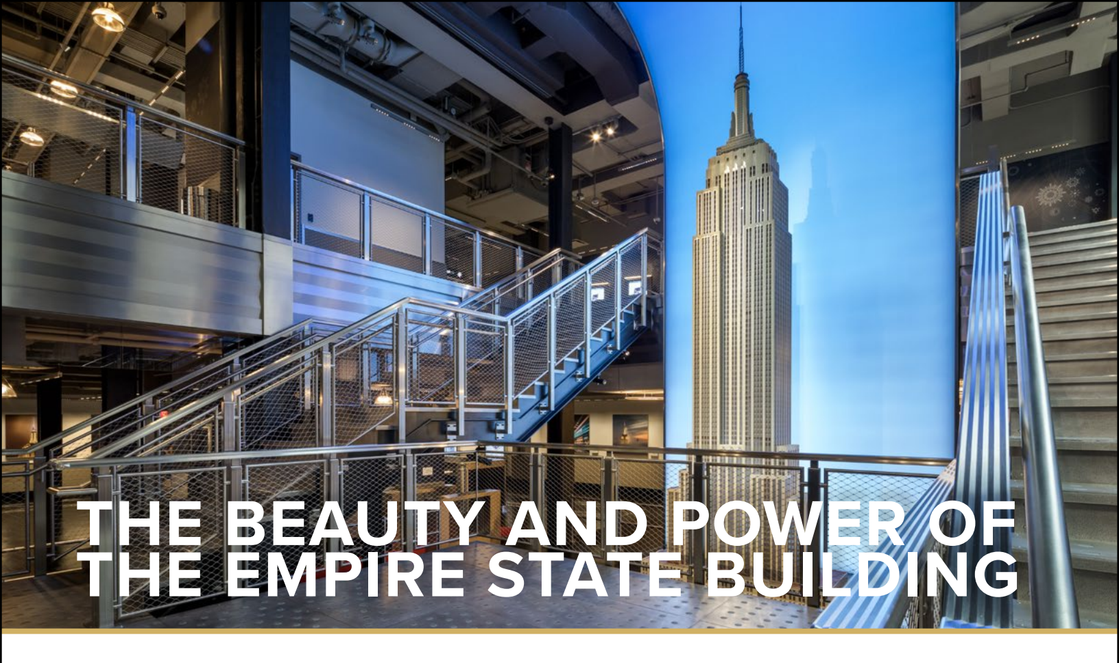
Exhibit Connections: Wonder of the Modern World, Artistry in Light, Windows opposite the exhibits provide a view of the external details of the Empire State Building, Stephen Wiltshire and Observation Deck